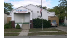
Photo Link: http://i157.photobucket.com/albums/t74/ferndaledda/properties/400E9Mile.jpg

177 Vester St. Parcel ID: 2527381025 Location Description: 1 block north of Woodward For Sale/Lease Square Feet: 4,500 Zoning: CBD Terms: $295,000 Contact Info: Guy Scavone, Scavone Properties 248-812-9080