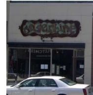
Photo Link: http://s157.photobucket.com/albums/t74/ferndaledda/Business%20List/?action=view&current=0234WNineMileMotherFletchers.jpg

241 West Nine Mile Parcel ID: 2534126005 Location Description: west of Woodward on south side For Lease Square Feet: 1,800 Zoning: CBD Terms: $2,400/month + utilities Contact Info: Mike Chudnow 248-661-1253